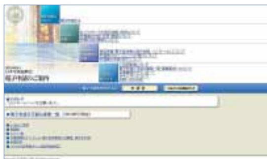
Top page of Japanese system instructions

At present, applications can be submitted using the new electronic system under the following programs: SAKURA Program, joint research projects and scientific seminars under JSPS's bilateral programs, and Japan-US Cooperation in Cancer Research Program. In the future,