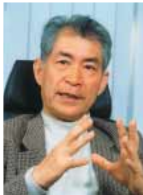
Dr. Tasuku Honjo

The director and deputy directors administer the Center's programs and research staff. Senior program officers coordinate their respective research groups. Under the new framework, Senior Program Officer Meetings are held to deliberate ways to promote science, consider advice to be provided on JSPS programs, coordinate cross-group activities, and plan the implementation of the Center's research and other programs. These meetings are attended by the director, deputy directors, and senior program officers. They will be held at an increased