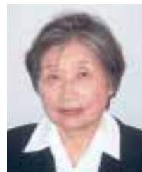
Dr. Tsuneko Okazaki

Dr. Tsuneko Okazaki, professor, Institute for Comprehensive Medical Science, Fujita Health University, has been appointed as the director of JSPS's office in Stockholm. In 1956, she graduated from the School of Science, Nagoya University. Thereafter, she went on to hold the posts of research assistant, associate professor and, in 1983, professor at the same university. From 1964-5, she conducted research under a JSPS fellowship. She had previously interned in the US. From that experience, she went on to discover discontinuous DNA replication, or what is now known as the "Okazaki Fragment." As a researcher herself, Dr. Okazaki will draw upon her vast experience in promoting scientific exchange between Japan, Sweden and its surrounding countries in northern Europe.