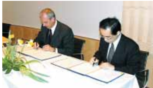
Signing the MOU