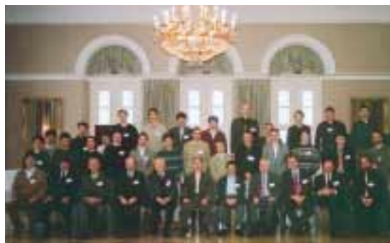
Participants of colloquium

outskirts of Munich. Observations and discussions enjoyed on the tour furthered mutual understanding on the state of the art in the field of quantum optics.