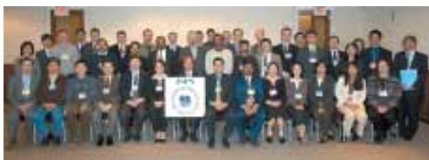
Volunteer alumni fellows and JSPS staffs