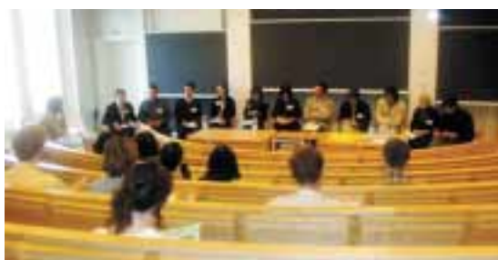
Open panel discussion