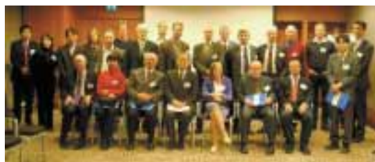
First alumni association meeting

At the reception following the meeting, the members treated their palates to Japanese hors d'oeuvres with nostalgic flavors; and while reminiscing about their experiences in Japan, energetically swapped ideas on future Club initiatives. The reception proved to be an excellent opportunity for the participants to jell as a group while strengthening their ties as friends and colleagues.