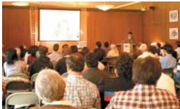
Hall packed with participants

More than 100 UCB researchers and students and other academics from the Bay Area attended the event. Through its process of considering "transformations of experience," the colloquium was very meaningful in that it provided a platform for researchers to present unique work being conducted in the two countries on such subjects as the history of science and philosophy.