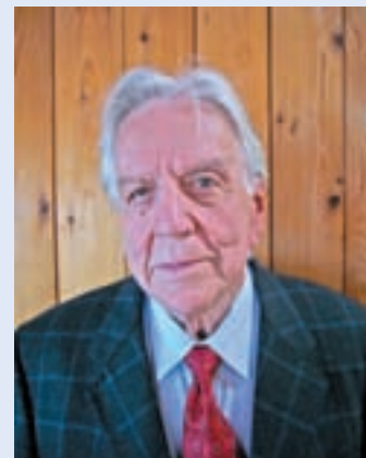
Dr. David Swenson Hogness

Dr. Hogness has been elected a member of the National Academy of Sciences (USA), an honorary member of the Japanese Biochemical Society, and an associate member of the European Molecular Biology Organization (EMBO), among other honors. He has also received many awards, including the Genetics Society of America Medal; Germany's Humboldt Research Award; the Darwin Prize of the University of Edinburgh; and the