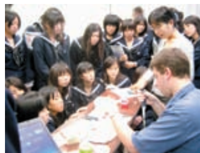
Fellow and students culturing phages and intestinal bacteria

student from his lab provide commentary in Japanese.