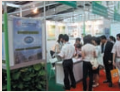
Japan Fair in Guangzhou

The office has also carried out a number of activities to support the internationalization efforts of Japanese universities and to advertise JSPS's programs. On 15-18 September, it participated in the Japan Fair in Guangzhou, which attracted some 300