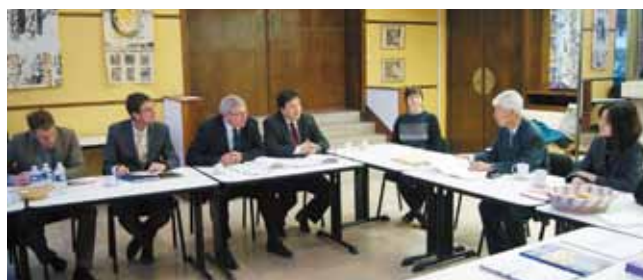
Explaining JSPS programs