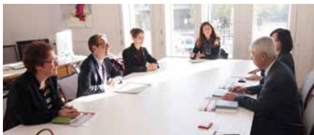
University president welcoming JSPS staff

The office members were also given the opportunity to visit one of the university’s laboratories, named CEISAM (Interdisciplinary