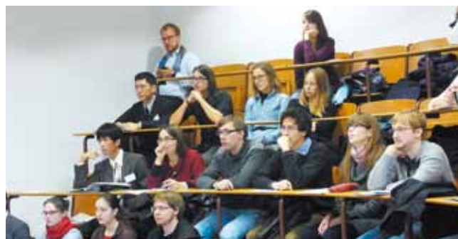
Students listening to briefing