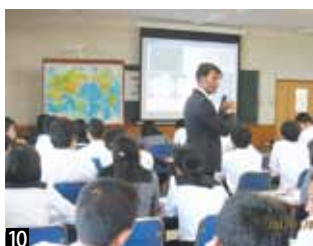
6. Toyama Senior High School 7. Kofu First High School 8-9. Tsuru High School 10. Nobeoka High School