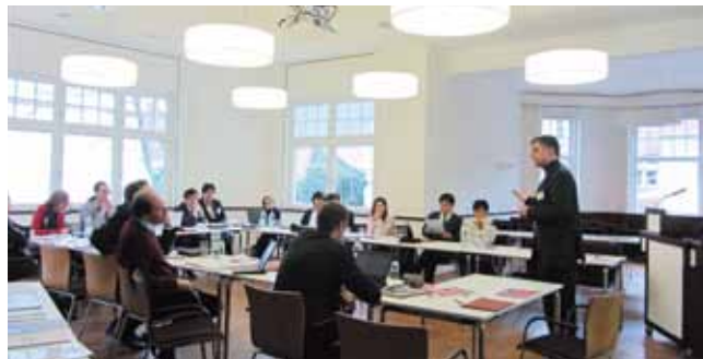
During the discussion