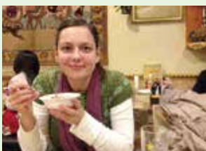
Enjoying Uyghur cuisine