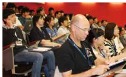
Participants attentively listening to presentations

On 9-11 July, JSPS London supported a UK-Japan astrophysics symposium held at the University of Oxford. Ninety-seven people attended, almost half being Japanese, a notable number of whom were postgraduate students. The purpose of this conference was to disseminate the latest results in astronomical research output from the AKARI infrared astronomy satellite launched in 2006 and to discuss the legacy of its data while making plans for the next major Japanese-European venture, the SPICA infrared space telescope. The symposium, therefore, marked an important next-phase juncture in expanding an already fruitful collaboration among the Japan Aerospace Exploration