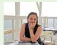
On Enoshima, a lovely one-day trip from Tokyo

believe me, you will—you can go for a long walk to Vowz, a small bar unique for the fact that it is run by a Buddhist priest. It is a place where you can drink cocktails with religious names against a background sound of sutra chanting and receive spiritual counselling should you wish. This might be a bit of a shock even for those familiar with the particularities of Japanese Buddhism, but it is one of the experimental attempts to bring Buddhism and Buddhist priests closer to the everyday life and concerns of ordinary people.