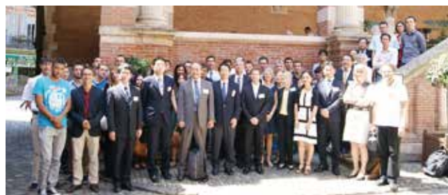
Participants in courtyard of Hôtel d'Assézat