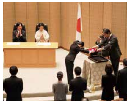
Receiving the Ikushi certificate and medal