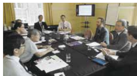
Discussion on JSPS international programs