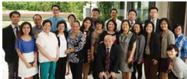
JSPS staff and JAAP members