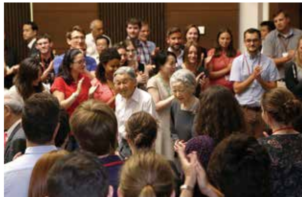
Welcome reception attended by the Emperor and Empress

Featuring a research internship for the participants at a host institution, the Summer Program began with a one-week orientation held by the cosponsoring Graduate University for Advanced Studies in the seaside town of Hayama. At it, the fellows received special lectures, gave poster presentations, attended classes in Japanese language learning, engaged in Japanese culture activities, and experienced Japanese living through homestay with a Japanese family. The welcome reception for them was attended by Their Majesties the Emperor and Empress of Japan, who enjoyed exchanging views and chatting with the young researchers. After the orientation, the young researchers went their separate ways to their respective host institutions. Their summer internships afforded them an experience upon which to consider coming back to Japan to do research at future junctures in their careers. On the day