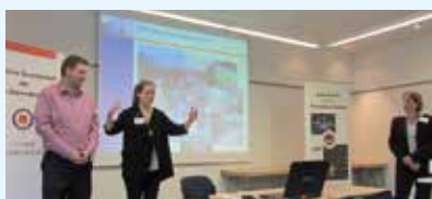
Former fellow's presentation