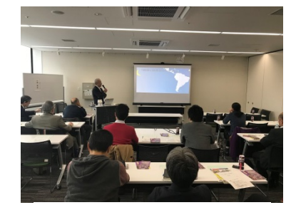
International relations lecture

At the meeting of the executive committee of the three universities in December and the meeting of the external evaluation committee in February, participants examined policy for future efforts, based on interim evaluation results, and studied how to continue the project after the termination of financial assistance.