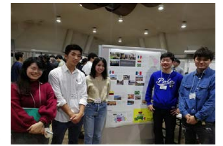
Presentation at the Tama Joint Colloquium

[Active participation by returned students] International students for fiscal years 2016 and 2017 took jobs after returning to their home countries and graduating in Directorate-General for Asia-Pacific of the Secretariat of Foreign Affairs of Mexico (1 student), Colombian-Japanese Chamber of Commerce and Industry Medellín Office (1 student), Japan International Cooperation Agency Peru office (1 student). Making use of their experience of studying abroad through this project, they are now actively participating as bridges spanning Japan and Latin America.