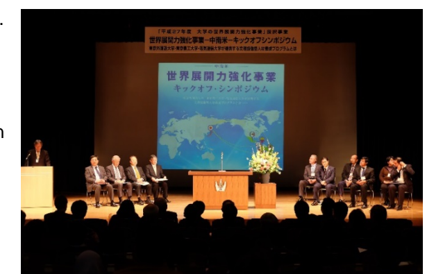
The kick-off symposium

- The three universities held "Study Abroad Achievements Report Meeting".