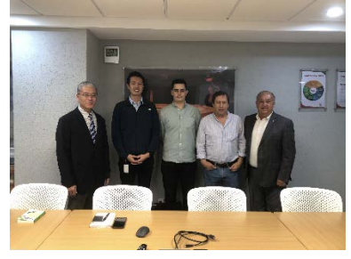
⟨Overseas Jitsumu-Kunren internship program at FRISA, Mexico⟩