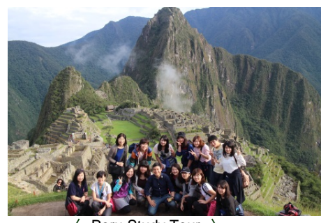
( Peru Study Four )