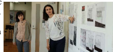
(Turkish student making a presentation during the architecture workshop)

[Inbound] Two Turkish students visited TUA to participate in a workshop themed on Japanese urban space co-hosted by the Bond University of Australia. TUA also hosted a student of glass design from Mimar Sinan, who participated in an international glass art workshop, “Always a Student” organized by the TUA Glass Course.