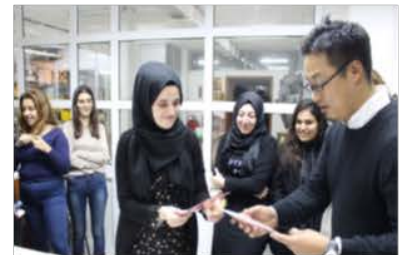
(Workshop at Anadolu University)

[Inbound] TUA's Intermedia Department hosted a long-term exchange student from Anadolu, who visited exhibitions related to TUA's faculty members as well as taking regular classes along with Japanese students. TUA also hosted ceramic students, who participated in pottery workshops using a climbing kiln, the main type of kiln used in Japan. The students were asked to bring their unfinished works that were made of clay from Turkey and worked with TUA students around the clock to have their work fired in the kiln. Two other painting students visited Geidai Factory Lab, where was newly opened aimed at providing opportunities for the public to experience craft activities, and learn how to make Washi Japanese paper.