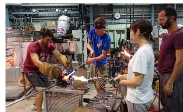
(Workshop at Anadolu University)

[Inbound] A Student of Anadolu University attended an international glass art workshop “Always a Student” organized by the TUA glass course. Students from four institutions in three countries learned, under the supervision of an instructor, techniques of glassblowing, whereas three Turkish students majoring in ceramics participated in a workshop on Noborigama (climbing kiln) . They visited the city of Mashiko, where they had a tour of local galleries and residence facilities, as well as the Fujiwara Earthen Art Studio, to learn more about the integration of traditional crafts and industrial design practiced in modern society.