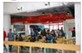
(Campus of Bezalel Academy of Arts and Design)

[Inbound] TUA accepted four students from Bezalel Academy as long-term exchange students to provide opportunity to learn Japanese arts and culture. Besides, in summer, two students joined TUA's annual research trip to Nara and Kyoto. The students visited temples and shrines with the guidance of the faculty specializing in ancient art. Three other students came to Japan to take part in a workshop on Societal Design in Northern Europe that was co-organized by TUA and Finnish educational institutes.