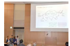
Presentation in the symposium

With the attendance of Her Imperial Highness Princess Akiko of Mikasa, the Turkish Ambassador to Japan and the President of the Japan-Turkey Society, TUA organized the “Joint Symposium for Selected Schools” and disseminated information to not only the field of fine art.