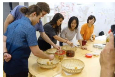
(Joint workshop with the Bezalel Academy of Arts and Design )

[Inbound] Two each students from Bezalel took part in workshops held at TUA; one on Japanese urban space co-hosted by the Bond University of Australia, and the other exploring visual icons of Israel and Japan, “Visual Icons – Ume vs. Olive.” Another student from the Bezalel Academy participated in the joint program between the TUA Department of Sculpture and the Academy of Fine Arts Münster, whereas two more students participated in the international glass art workshop “Always a Student.” TUA also hosted two long-term exchange students – one student each per semester.