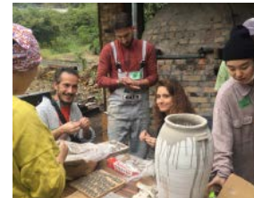
Students of Anadolu University at Noborigama