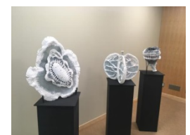
Glass works at the exhibition