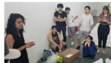
Sculpture program joined by the students from Bezalel Academy of Arts and Design in Munster, Germany

[Inbound] Three students participated in “TOKÜNSTERALEM” (a coined word in which the names of the cities of 3 universities were mixed: Tokyo, Munster, Jerusalem) held in cooperation with Munster Academy of Art, Germany. The department of sculpture of TUA joined the class organized with the Lasalle College of Arts, Singapore and made a presentation about works and deepened exchanges. Two students participated in the training of Noborigama conducted with the Anadolu University. TUA hosted four students for the first semester, two students for the second semester as long-term international students.