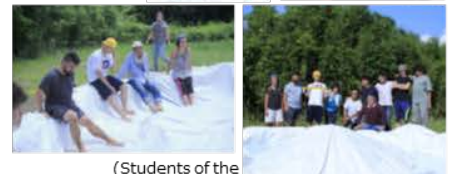
(Students of the two countries worked together)

[Inbound] Students at Mimar Sinan visited Japan to join workshops hosted by TUA. Two architecture students participated in one on how to design urban space in Tokyo, which was held in collaboration with Bond University of Australia. Besides, Mimar Sinan and TUA organized a joint-workshop on the relationship between space and sculpture. Two students majoring in sculpture at Mimar Sinan joined it.