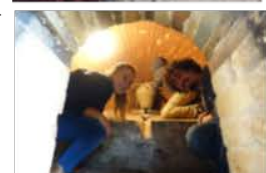
(pottery workshops using a climbing kiln)