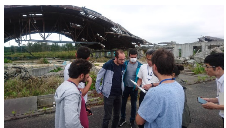
(Inbound Program: Visit to Okuma Town in Fukushima>

To accommodate the higher volume of exchange students, which would have surpassed the number stipulated in our university-level agreement, Niigata U sighed an MOU specific to this project with Middle East Technical U, as it had done earlier with Ankara U and Ege U. Meanwhile, tutors and/or teaching assistants were assigned to inbounders to better ensure their learning. Moreover, for a quality assurance purpose, their learning was assessed by their academic advisors, and upon which academic credits were awarded.