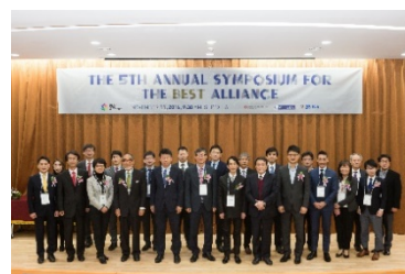
< November, BEST Alliance Symposium in Seoul >

Double Degree Program with Renmin University has been started.