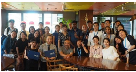
〈 Doing Business in Asia 〉

This program is developed for MBA students of Hitotsubashi University ICS (hereinafter “ICS”), Peking University Guanghua School of Management (hereinafter “PKU”), and Seoul National University Business School (hereinafter “SNU”) to participate in a double degree program, a term-long exchange program, and summer intensive program. Also, faculty members of the three schools work on Joint Research Projects, and the findings are presented in an annual “BEST Symposium.” All the programs, the committee conference, information sessions, and BEST Alliance Symposium were facilitated as scheduled in FY2018.