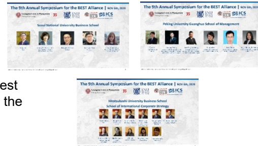
〈BEST Alliance Symposium 2020〉

The BEST Alliance agreement, which is the basis of this project, was renewed, and the cooperative system for student exchange and joint research was firmly established. In November 2020, the BEST Alliance Symposium was held online to share the results of joint research and best practices for countermeasures against new corona virus. In December, the SNU Study Tour was held online, and guest speakers from Japanese companies were invited to give short intensive lectures to Korean MBA program students.