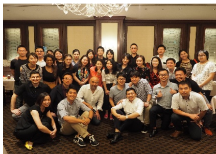
〈 Doing Business In Asia 〉

This program is developed for MBA students of Hitotsubashi University ICS (hereinafter “ICS”), Peking University Guanghua School of Management (hereinafter “PKU”), and Seoul National University Business School (hereinafter “SNU”) to participate in a double degree program, a term-long exchange program, and Summer intensive program. Also, faculty members of the three schools work on joint research projects, and outcomes are presented in an annual “BEST Symposium”. All the programs, the committee conference, information sessions and BEST Alliance Symposium were facilitated as scheduled.