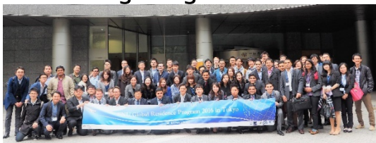
< November, Seoul University Study Tour >