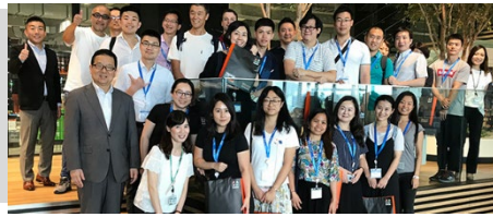
〈 Doing Business in Asia 〉

This program is developed for MBA students of Hitotsubashi University ICS (hereinafter “ICS”), Peking University Guanghua School of Management (hereinafter “PKU”), and Seoul National University Business School (hereinafter “SNU”) to participate in a double degree program, a term-long exchange program, and summer intensive program. Also, faculty members of the three schools work on Joint Research Projects, and the findings are presented in an annual “BEST Symposium.” All the programs, the committee conference, information sessions, and BEST Alliance Symposium were facilitated as scheduled in FY2019.