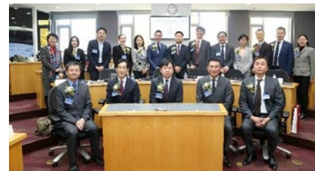
〈 BEST Symposium 〉

BEST Alliance Symposium was held on November 9, by PKU. All the members from three schools shared the updated information of the program, keynote speeches, and joint research partner. Further development of the partnership in the advanced program was confirmed during the Symposium.