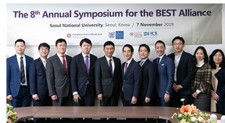
〈 BEST Symposium 〉

All the members from three schools shared the updated information of the program, keynote speeches, and joint research partner. Further development of the partnership in the advanced program was confirmed during the Symposium.