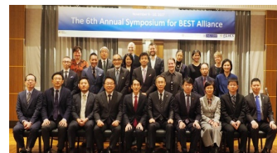
〈 BEST Symposium 〉