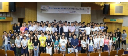
〈Summer School in PNU 2016/8/16~8/26〉