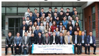
Spring Seminar in SJTU