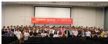
Summer School in Kyushu Univ.