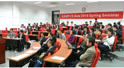
〈Spring Seminar in SJTU 2016/4/26~4/28〉