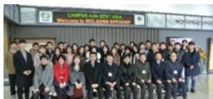
Spring Seminar (PNU)