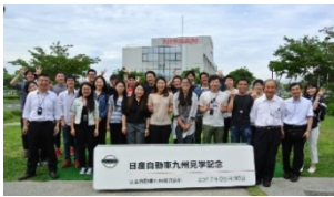
Field Trip to Kitakyushu

◆ Field Trip to Kitakyushu area (June/July, 2017)