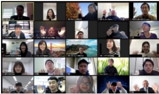
(22 nd CSS-EEST by Zoom)