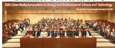
21 st CSS-EEST Seminar in SJTU