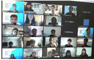
(SJTU Summer School by Zoom)

Due to the outbreak of COVID-19, no KU students were physically dispatched, but 3 inbound students, 1 from PNU, 2 from SJTU, actually came to Japan and carried out the research work at their affiliated laboratories in KU. Also, all 3 universities decided to offer the online classes for DD students, outbound and inbound DD students could take the courses with the required credits by online at the relevant university. (Outbound DD: PNU2·SJTU1 / Inbound DD: PNU1·SJTU3)