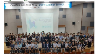
Summer School in PNU