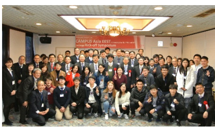
〈Kick-off Symposium in KU 2017/2/22〉