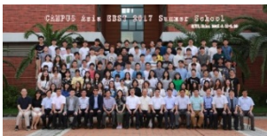
Summer School (SJTU)

PNU conducted Spring Seminar held in Gyeongju, Korea, and 11 EEST course students joined and fulfilled international research exchange for 3 days.