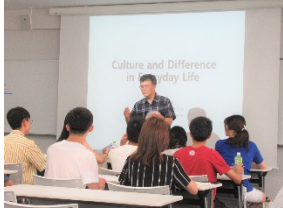
< Summer Program in Tokyo >