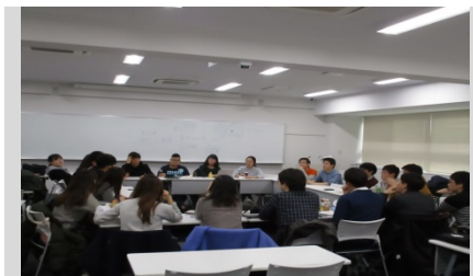
〈Group work during winter program at UTokyo 〉