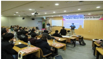
< Winter Program in Seoul >

<Type A-②Student-Exchange Program> <Type A-② Short-Term Program>