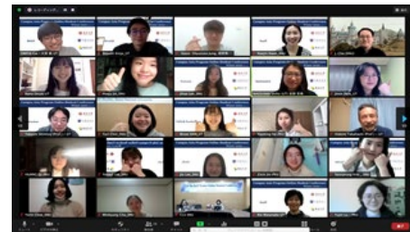
< Online Winter Program >