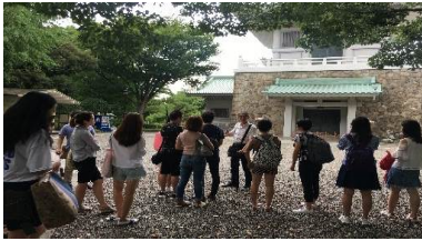
< Summer Program in Tokyo >