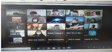
< Online Autumn Program >