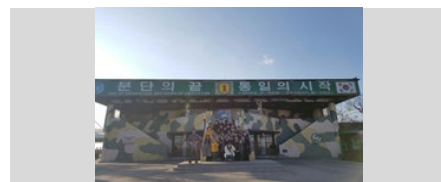
〈On field trip during winter program at SNU〉