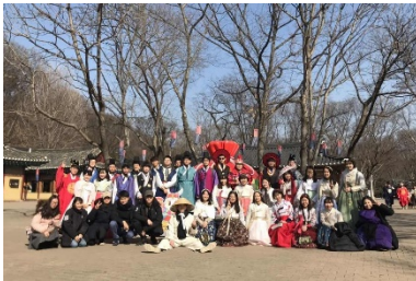
〈 Winter Program in Seoul 〉

〈Type A-②Student-Exchange Program〉〈Type A-② Short-Term Program〉