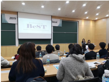
< Winter Program in Seoul >

<Type A-②Student-Exchange Program> <Type A-② Short-Term Program>