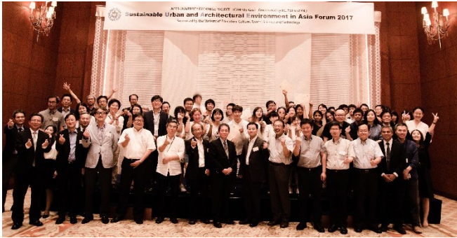
〈 2017/8/25 SUAE Asia Forum 2017 〉

The exchange program conducted with the collaboration of Pusan National University and Tongji University in 2017 was a great success, and 114 students from three universities participated in international workshops. Especially, 21 students from three universities participated the Summer School 2017. It offered a great opportunity for students from three universities to gather in Fukuoka and present their unique Urban Design proposal. Furthermore, the SUAE Asia Forum 2017 and a symposium was held during this summer school to exchanged the experience of internationalization of education such as student-mobility, promoting students to study abroad and credits transfer system among universities.