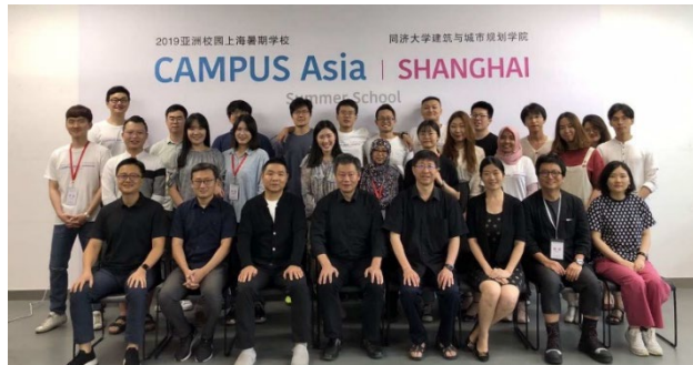
< 2019 Summer School at Tongji University >

We received 6 students and sent 3 students for the Double Degree Program since April 2018. Tongji University organized the Summer School in August 2019. Lectures and design workshops of the Summer School were organized as intensive courses to reduce the burden on students. Six students joined the Construction Festival at TJU annually in June. And 11 students participated in BIADW in July. We received 13 students for SDC. Kyushu University organized the SDC with the participation of 63 students from 7 universities in August.