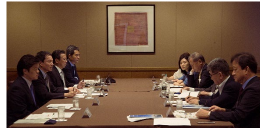
〈 2017/8/25 Accreditation Committee 〉

The Accreditation Committee was held on August 25 th , and the committee members have joined from other universities. We set 6 criteria to evaluate the program in order to assure the quality. We earned "A" rating for almost all of the evaluation criteria.