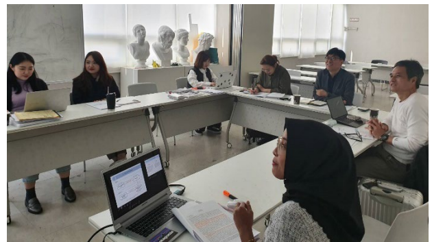
< 2019 Double Degree Program >

All international students are assigned to their desired laboratory to evaluate their admission and to guide during their stay. Additionally, we provided English orientation to on the course registrations and required credits. The orientation also helped them to have safe and comfortable student life. By utilizing our educational web system, students stay connected with their supervisor at home university on regular basis.