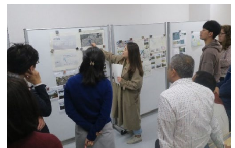
< Double Degree students >

Summer School, Cooperative education program was held in Busan in August. KYU also held Sustainable Design Camp and it provided opportunity to interact with other international students. They could get many chances to communicate with others in English by participating these design studio classes.