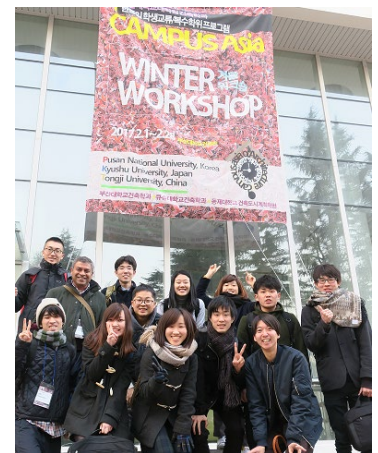
Pusan Winter Workshop in 2017

Sending students We have started offering counseling for students participating study abroad programs. The Education Web system which was installed and started operating will allow us to support educational needs of students during their study abroad period. A seminar will be organized to help them improve their English before going abroad. We will check each universities' lectures and class curriculums to help students to find relevant courses.