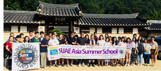
< Summer School 2018 in Busan >

On December, thesis presentation was carried out for DDP students with partner university by using Web meeting system. To make DDP students accomplish their degree, master’s thesis assessment was made by CA committee formed by three universities. In addition, 14 lectures now open for international students will be provided in English and Japanese.