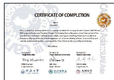
〈 Double Degree Certification 〉

Double Degree Program students will gain the certification from each University when they complete the master course. In addition to this, Certificate of Completion of was issued to the participants who has completed the Double Degree Program.