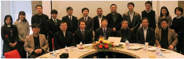
Three Universities Meeting in Shanghai

Five students were sent to China and Busan for short-term exchanges. Twelve students have joined the Pusan Winter Workshop in February 2017. Students from all three universities gathered during these exchanges and shared their experiences.