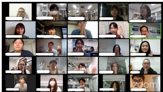
〈 Sustainable Design Camp 2020 〉

All the programs have been conducted online, due to the spread of the Covid-19. We accepted 9 Double Degree Program participants and provided online lectures. In terms of Summer School, we shifted each program date and divided it into three parts. And we also accepted 11 students for the short-term program. Four Kyushu University participated in the only online program organized by Pusan National university this year.