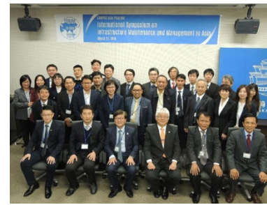
International Symposium on Infrastructure

One of the undergraduate students who had participated in the “Summer School on Infrastructure” hosted at Sungkyunkwan University, Korea during the summer break in 2017 showed strong interest in the long-term (one year) exchange program base on the DD Program. He decided to continue his study and research at the Graduate School of Engineering, and from early September 2018, he started the DD Program at Shandong University, China. His academic performance has been highly recognized by the supervisor at Shandong University.