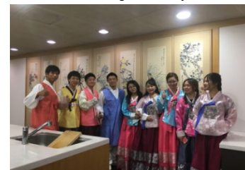
Summer Program at Sungkyunkwan University