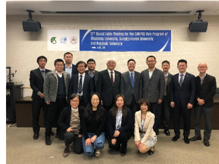
The 12 th Round Table Meeting in Nagasaki

Two Japanese Double Degree Program students presented their master's thesis defense in English at each university, and they were awarded master's degrees in both NU and SDU at the end of last March. By forming common subjects on infrastructure between the three universities as part of the Double Degree Program, the mutual exchange of faculty members among the universities was implemented and lectures were given. As a result, not only for the participants of the programs, it also gave great opportunities for other engineering students of each university to experience international exchange.