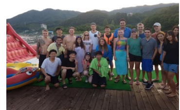
International Exchange Event at Sungkyunkwan University