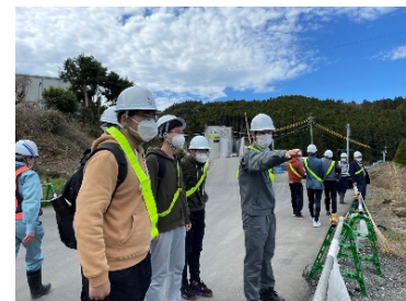
Field Trip to See a Tunnel Construction Project ordered by Nagasaki Prefecture. (Sasebo city on February 1, 2021)