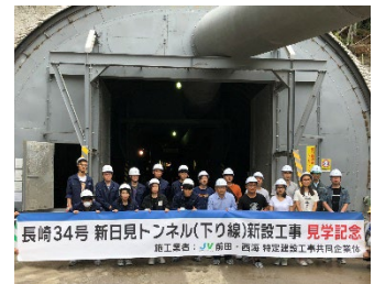
Onsite Field Trip for Inbound Students