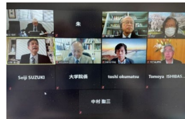
The External Evaluation Committee in Japan (Online Meeting on March 17, 2021)