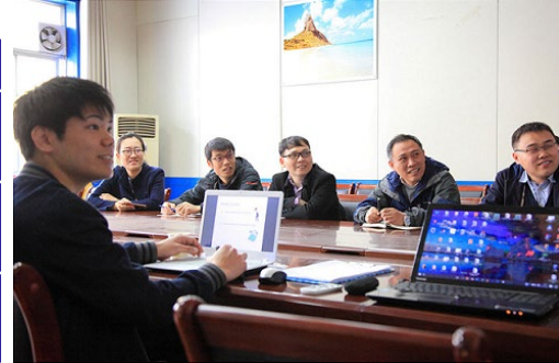
Research Presentation at Shandong University, China