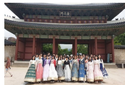
Summer School Program at SKKU