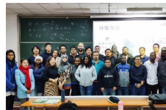
Exchange with International Students at Shandong University