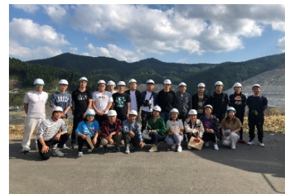
Field Study by students accepted at NU