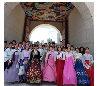
Summer Program at Sungkyunkwan University