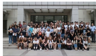
Short Term Exchange Program at SDU