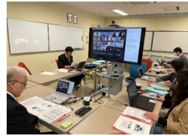
The Fourth Consortium Steering Committee for Nurturing Infrastructure Engineers (Online Meeting on March 26, 2021)

All three students from Shandong University who had been accepted to Nagasaki University as the first batch of the Double Degree Program were awarded master's degrees from Nagasaki University. To ensure educational quality of the Double Degree Program, supervisors of Shandong University participated in the students' thesis defense online as sub-judges of Nagasaki University, which allowed both universities to officially verify that the research meets the requirement for quality of education and research. We have further established a system to provide online lectures through the joint "International Course in Civil Infrastructure Maintenance," which has been developed as part of the Double Degree Program. This joint course consists of eight online classes related to infrastructure, with four classes offered respectively from Shandong University and Sungkyunkwan University. It is available for students at Nagasaki University as one of its common subjects.