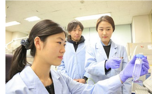
Experimental Laboratory of Sungkyunkwan University, Korea

The academic agreement along with MOU on student exchange have been concluded to ensure the trilateral relationship among partner universities. Trial program was also conducted for both outbound and inbound students in order to find issues to be addressed before the implementation of 6 months exchange program starting in FY2017.