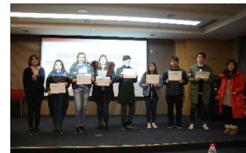
Exchange Program Completion Ceremony at Shandong University