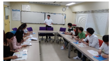
Orientation for Inbound Students