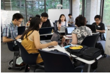
〈2017.8.9 Group Work at Summer School〉

•An assistant professor was newly hired, and “CAMPUS Asia courses” on Conflict Resolution and Social Innovation started from April with over 150 students.