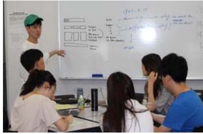
〈2018.8 Summer Program @ Waseda Univ.〉