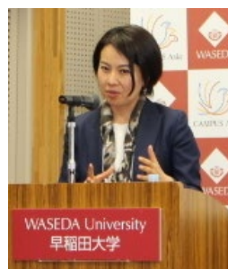
〈2018.5.15 Waseda Meets Global Leaders vol. 7〉