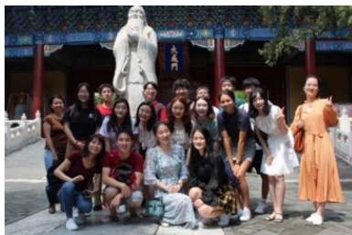
(2019.8 Summer Program @Peking Univ.)