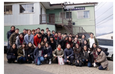
〈2018.2.9 Visit a local company in Iwate at Winter School〉

※Throughout Waseda Univ., we sent 36 to Peking Univ. and 4 to Korea Univ., and accepted 26 from PU and 14 from KU in FY2017.