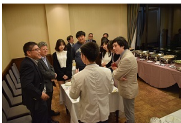
〈2017.4.19 Students and Faculties of 3 universities after Joint Workshop〉