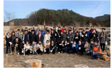
〈2019.2 Spring Program @ Iwate〉