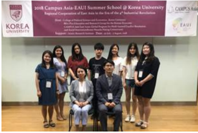
〈2018.7 Summer Program @ Korea Univ.〉