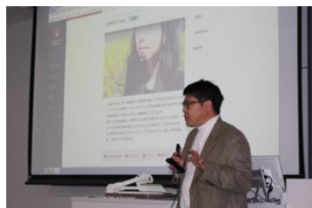
〈2017.4.3 Orientation at Waseda Univ.〉