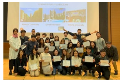
(2020.2 Spring Program @Waseda Univ.)