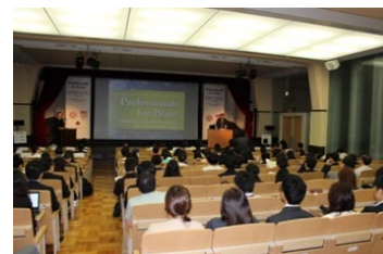
〈2017.4.20 Kick-off Symposium〉