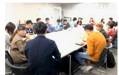
〈 2019.4 CAMPUS Asia Student Lunch @ Waseda Univ.〉