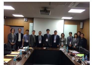
〈2017.9.20 ICPC Meeting @ Korea Univ.〉