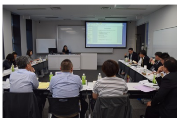
〈2017.4.19 Joint Workshop〉