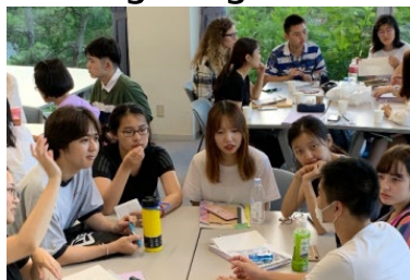
(2019.8 Summer Program @Waseda Univ.)