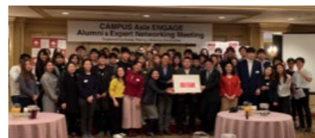
(2020.2 Alumni & Expert Networking Meeting co-hosted by Korea Univ. and Waseda Univ. @Waseda Univ. )