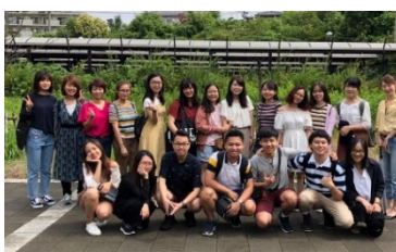
〈Outbound Program to Cambodia〉