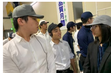
〈Inbound program from Singapore〉

We had already formed University network with quality assurance through Credit Transfer System and other agreements with partner Universities. Moreover, with supports from institutions, we have one-day/ half-a-day internship session in various companies as a substantial measure. Through discussion with company workers and presentation, students learned how to implement their lecture-based knowledges in real life as well as details about manufacturing, marketing and strategy-making.