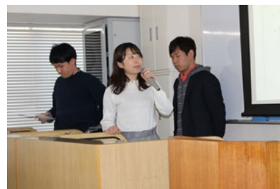
<FY2018 debriefing session>