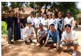
〈Outbound Program to Cambodia〉