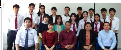
〈Outbound program to Laos〉