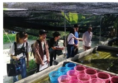
〈Outbound program to Thailand〉

Students are given program-related assignments few weeks before the program and asked to conduct a research and learn about the topics beforehand. International Centre of Nagoya University holds risk management orientation several times a year to inform overseas risks and cross-culture understandings. All the students has to participate this session. For long-term outbound research programs, professors help students to plan their studies to be more effective during their stay in overseas.