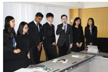
<Inbound program from Singapore>