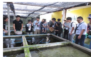
〈 Field Work in Cambodia〉

Participated students had chances to see actually in their eyes agricultural activities in a foreign country. During this program, they have discussed with students from our partner university in English and learnt not only academic contents but also how to cooperate with them.