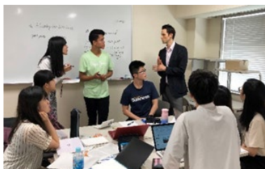
〈Workshop with local companies supported by Global Aichi〉

With the support of Global Aichi (General Incorporate Association), workshops have been held in July. Some companies which are willing to do their business in the partner country (Singapore) had joined the workshop to discuss about marketing strategies with students of Nagoya University and 6 students from National University of Singapore (NUS). Students gave presentations for companies. All suggestions are well appreciated by the companies. Relatedly, we were planning to do the field work with the same theme in Singapore in February, however, we had to cancel our outbound program due to the COVID-19. Although, students were actively pre-researched for the theme and were prepared for the outbound program.