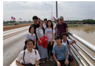
<Outbound program to Laos>