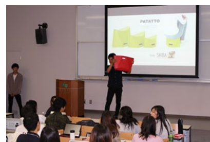
<Workshop with various companies supported by JETRO>