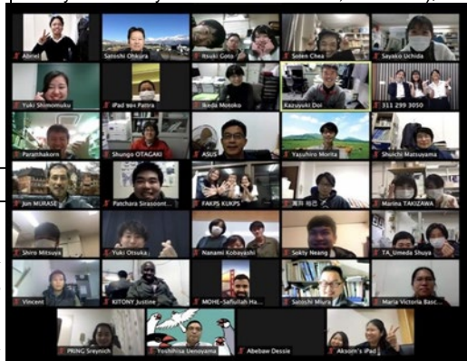
(Interaction via Zoom (Kasetsart University, Thailand))

Although travel itself were not possible, students in both Universities were given program-related assignment beforehand to research and prepare for online programs. We also planned the risk management orientation just in case the overseas travel were permitted. For long-term outbound research programs, professors helped students to plan their studies to be more effective during their stay in overseas.