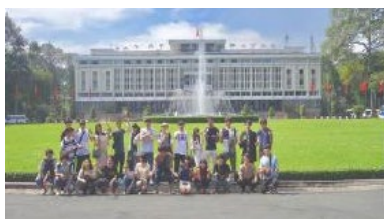
〈Outbound Program to Viet Nam〉

Our FY2017 Exchange programs had fully conducted as planned. Precisely, we have organized short term programs with 5 different countries to host and to send students; such as Cambodia, Laos, Myanmar, Viet Nam and Singapore. Each program trained students' communication skills and knowledge-use in society through experience-based education with many supports from our regional corporations and institutions.