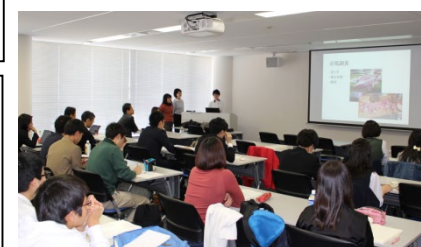
〈FY2017 debriefing session at Centrair〉