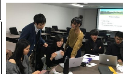
〈Workshop with various companies supported by JETRO〉