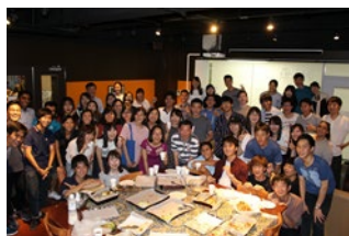
<Outbound Program to Cambodia>