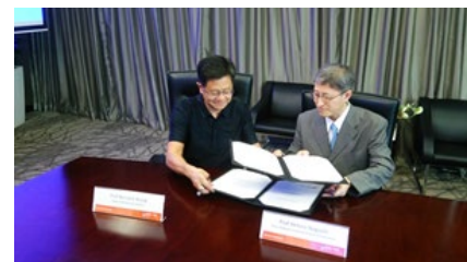
〈MOU extension ceremony at National University of Singapore〉

In order to organize an effective educational program, we discuss with our partner universities about the contents and credit point transfer system. We have already agreed that both parties will engage in finding appropriate solutions for common academic purpose.