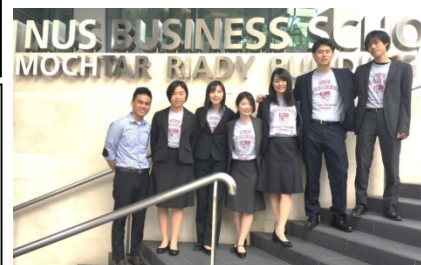
〈Outbound program to Singapore〉