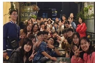
〈Outbound program to Vietnam〉

Through this program, our cooperation on research and education with ASEAN countries has been widen and strengthen through years. Students who are willing to study long-term in South-east Asia is gradually increasing. For information, we have Japanese-English bilingual website. Inbound and outbound Information are frequently updated so as students experience reports, pictures and feedbacks. We also have Facebook to actively release latest information to students and outside the University.