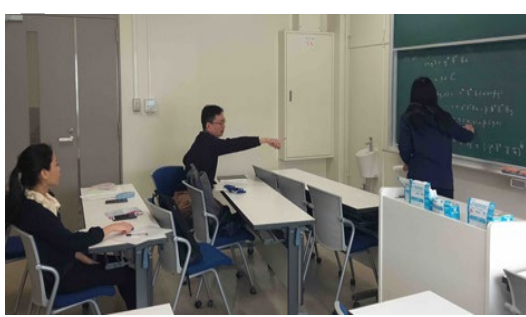
< Lecture in Nagoya University (Myanmar Program)

(Adopted year: (Adopted year: FY2016, (Type B- ASEAN))