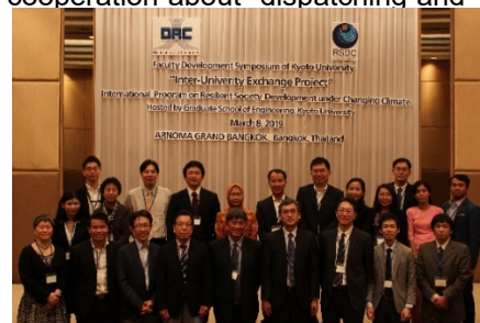
〈Attendants of the Faculty Development Symposium on March, 2019, in Bangkok〉

Facebook page: https://www.facebook.com/DRC-Kyoto-University-233253546869886/