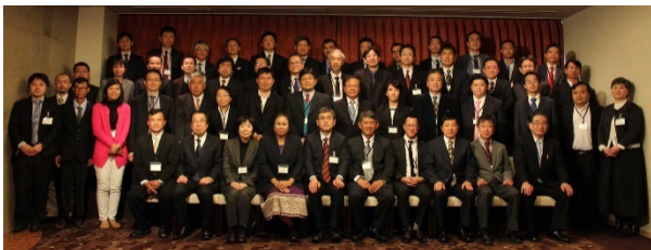
〈 Attendants of Opening FD Symposium〉

In order to prepare students mutual exchange program from FY2017, following activities are conducted.