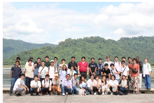
〈2. Two-directional short-term study abroad program〉

Program Development Meetings were held at Bangkok, Hanoi, and Kyoto.