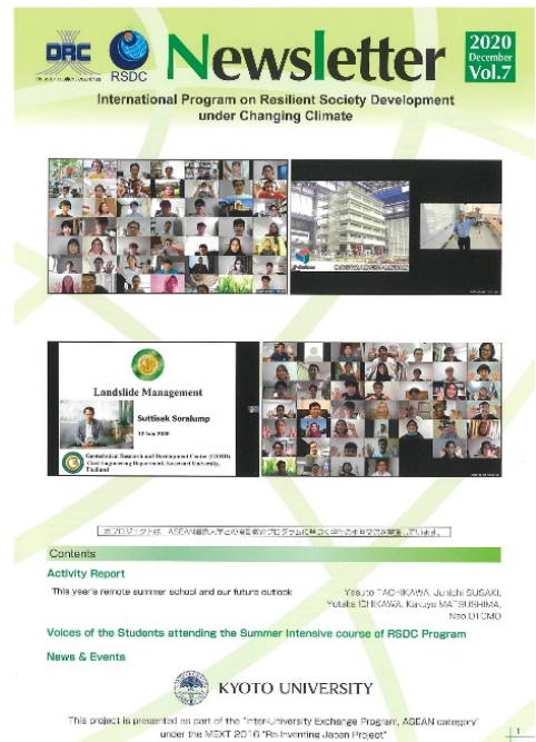
〈New letter Vol.7〉