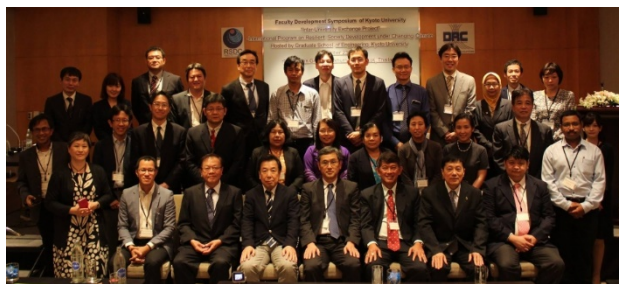
〈Attendants of the Faculty Development Symposium on November 2017, in Bangkok〉

Facebook page: https://www.facebook.com/DRC-Kyoto-University-233253546869886/