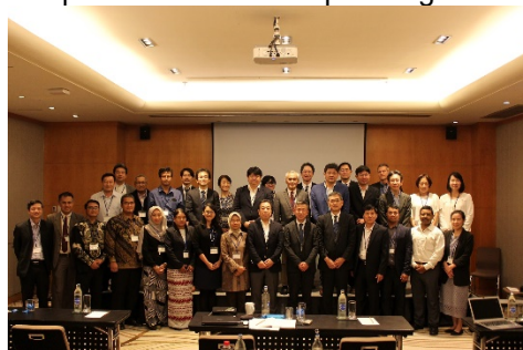
〈Attendants of the Faculty Development Symposium on January 2020, in Bangkok〉

Facebook page: https://www.facebook.com/DRC-Kyoto-University-233253546869886/