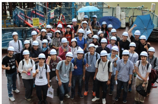
〈2. Two-directional short-term study abroad program〉