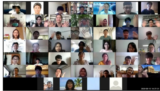
〈2. Two-directional short-term study abroad program〉

This year's program was conducted with new structure, where on-demand lectures and live group work activities were organically combined, in order to achieve effective outcome of the program even under COVID-19. Students enjoyed ice break activities before the official program, which makes them easier to promote online group work activities.