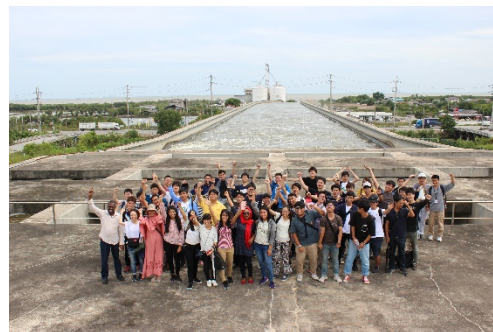
〈2. Two-directional short-term study abroad program〉

Program Development Meetings were held at Bangkok, Hanoi, Da Nang, Phnom Penh, Yangon, Mandalay, Malang, Bogor, and Kyoto.